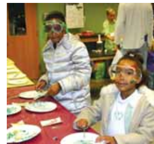
We're doing chemistry!