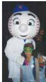
(Left) Our young chemist takes time to have her picture taken with "Mr. Met"