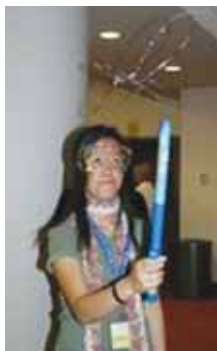
Floating in air.