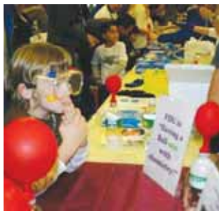
How does it do that?