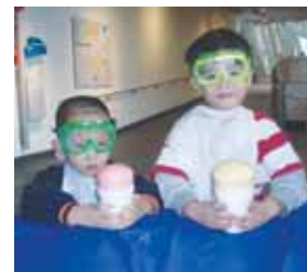
Look what we made! We certainly had a ball with chemistry!