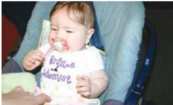
Future chemist indeed!!