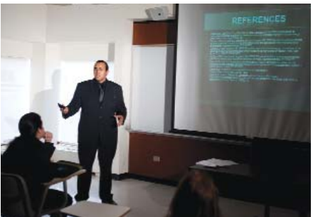
Student presenter from John Jay College of Criminal Justice.