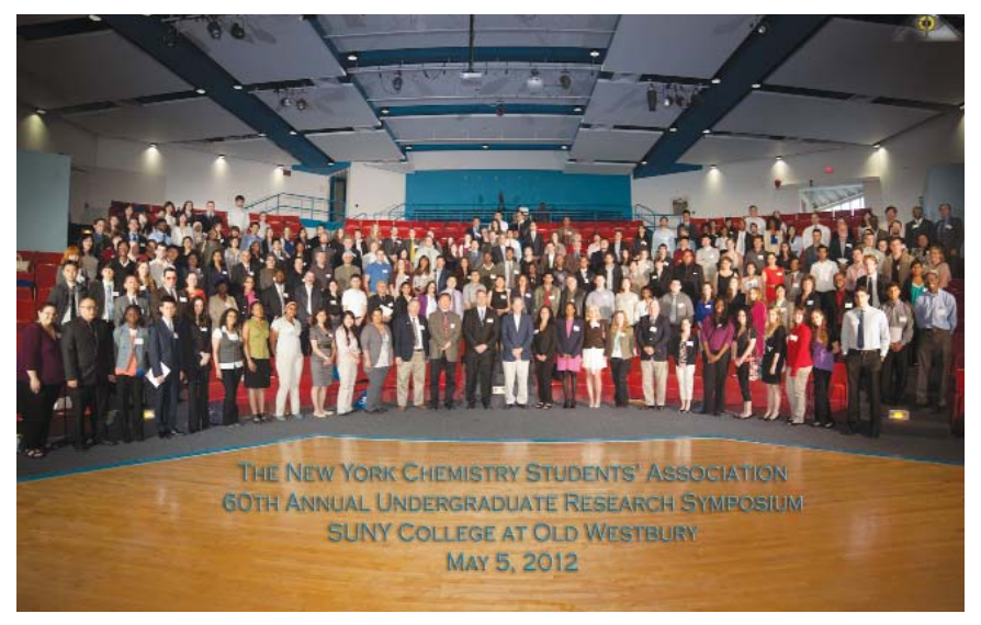
2012 Undergraduate Research Symposium participants.