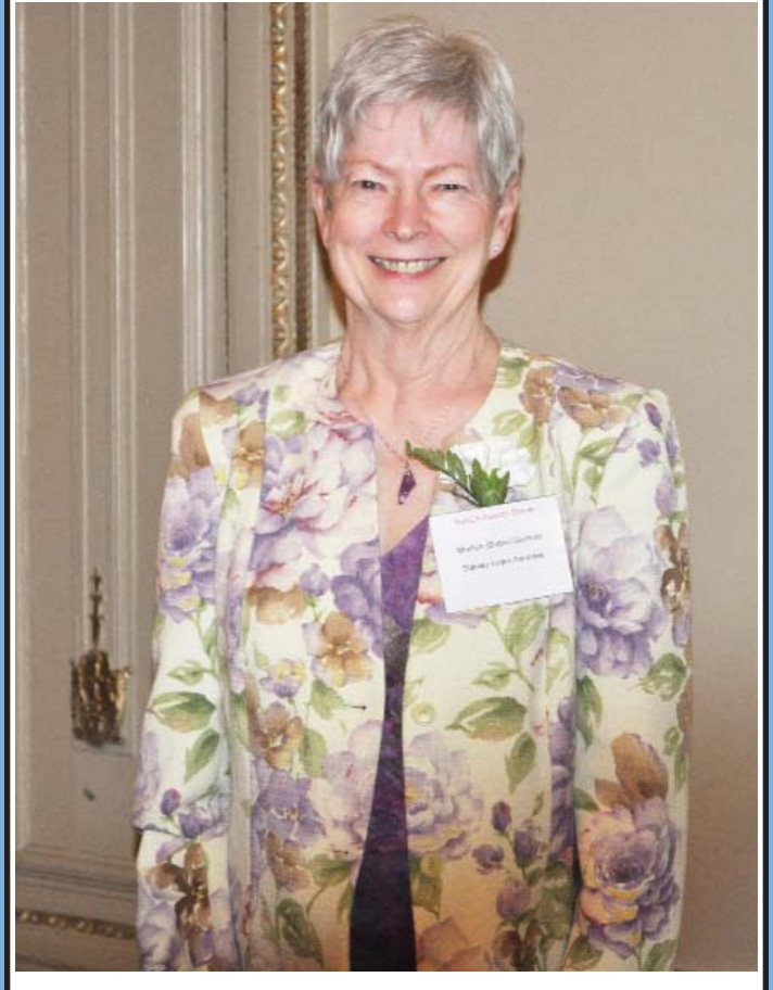
See article on page 16.