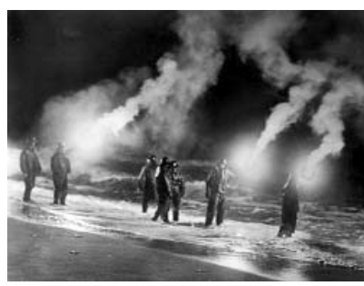
Lifesaving Service surfmen are shown practicing with Coston Signal flares in the undated photograph.