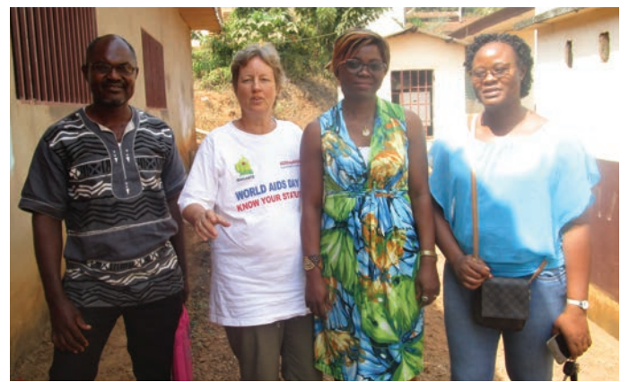
Top: AIDSfree AFRICA technicians.